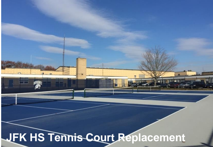
JFK HS Tennis Court Replacement