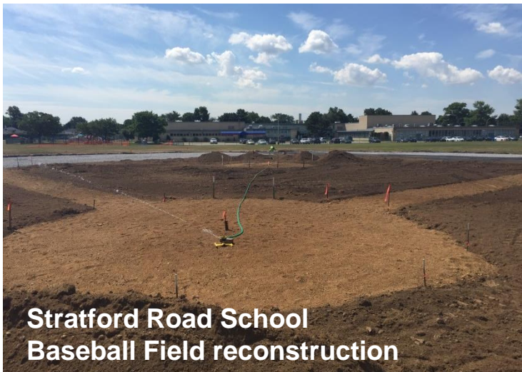
Stratford Road School Baseball Field reconstruction