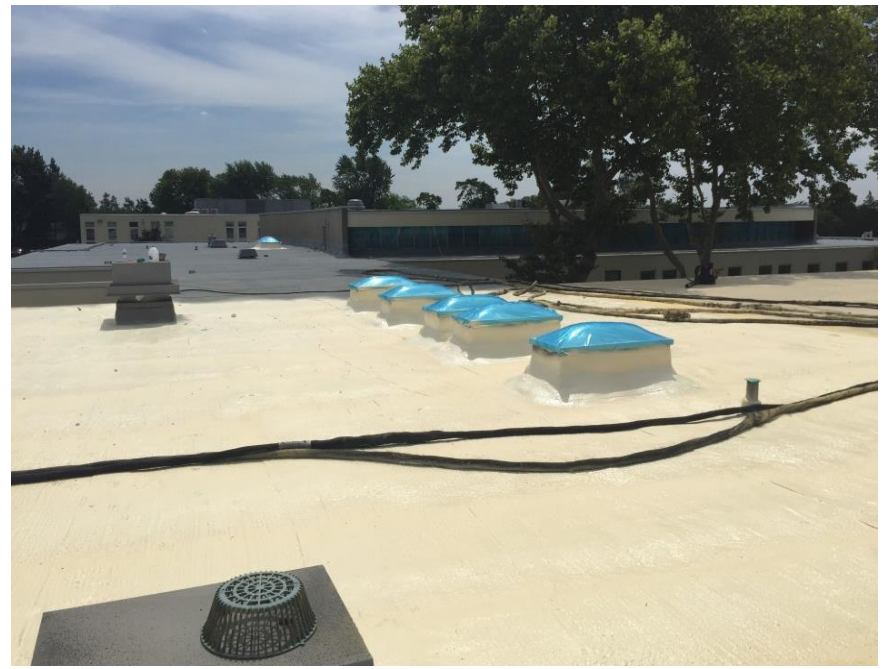
Mattlin MS Roofing and Skylights