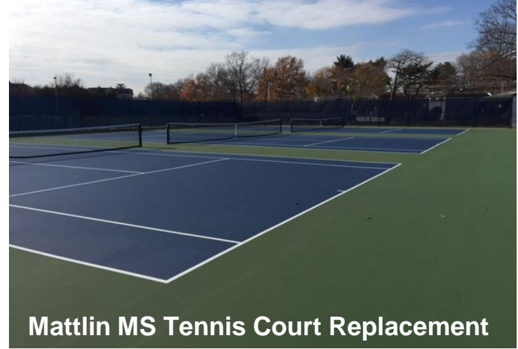
Mattlin MS Tennis Court Replacement