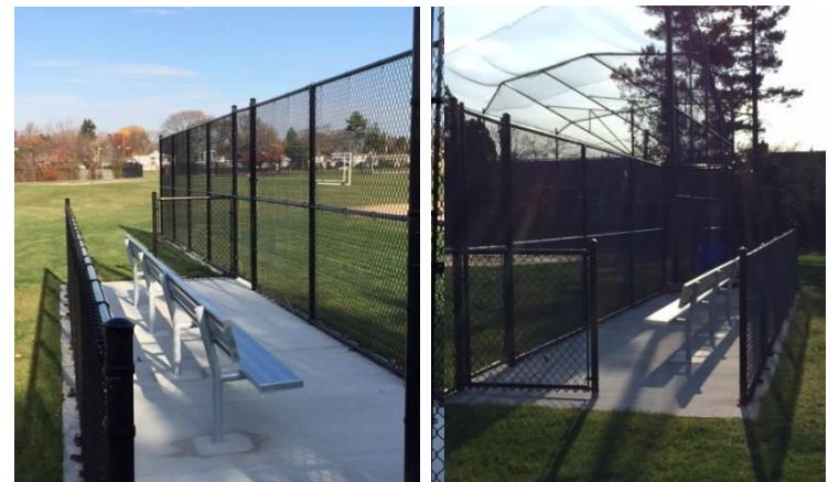
POB Middle School Baseball Field reconstruction